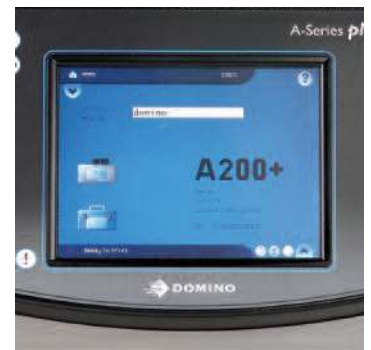
Optional touch screen control