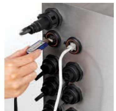
Ethernet and USB ports as standard