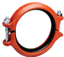
2 - 12"/50 - 300 mm