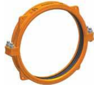
26 – 48"/660 – 1220 MM SIZES PATENTED