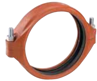
14 – 24"/350 – 600 MM SIZES PATENTED

Style W07 AGS couplings are provided with FlushSeal® gaskets for a variety of services. Please specify gasket grade when ordering. Please refer to publication 05.01 for gasket service ratings.