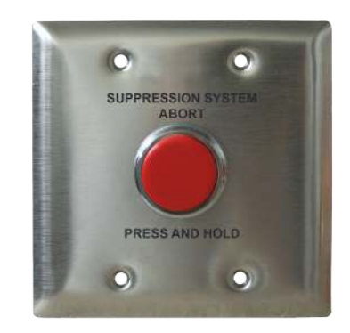
Stock number: 3001000 - RED BUTTON 3001004 - BLUE BUTTON