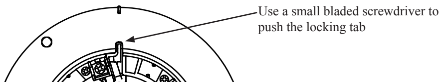
Figure 2. Removing of detector head from base