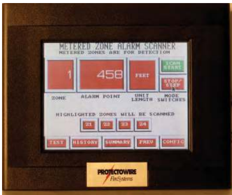
PCLC Graphic Display (2600HD3)