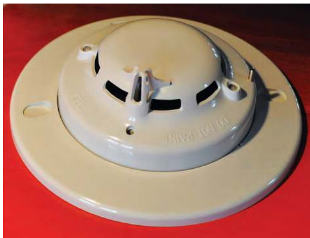
SLR-24H Combination Detector