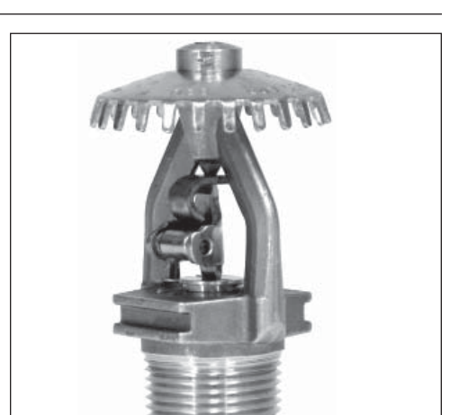
Sprinkler Identification Number RA1124