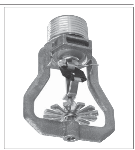
Model HL22 Sprinkler

Minimum System Operating Pressure: 55 psi (3.79 bar). Installation and Obstruction Criteria: Same as for K25.2 ESFR sprinklers, but with a maximum deflector to ceiling distance of 14 in. (356 mm)